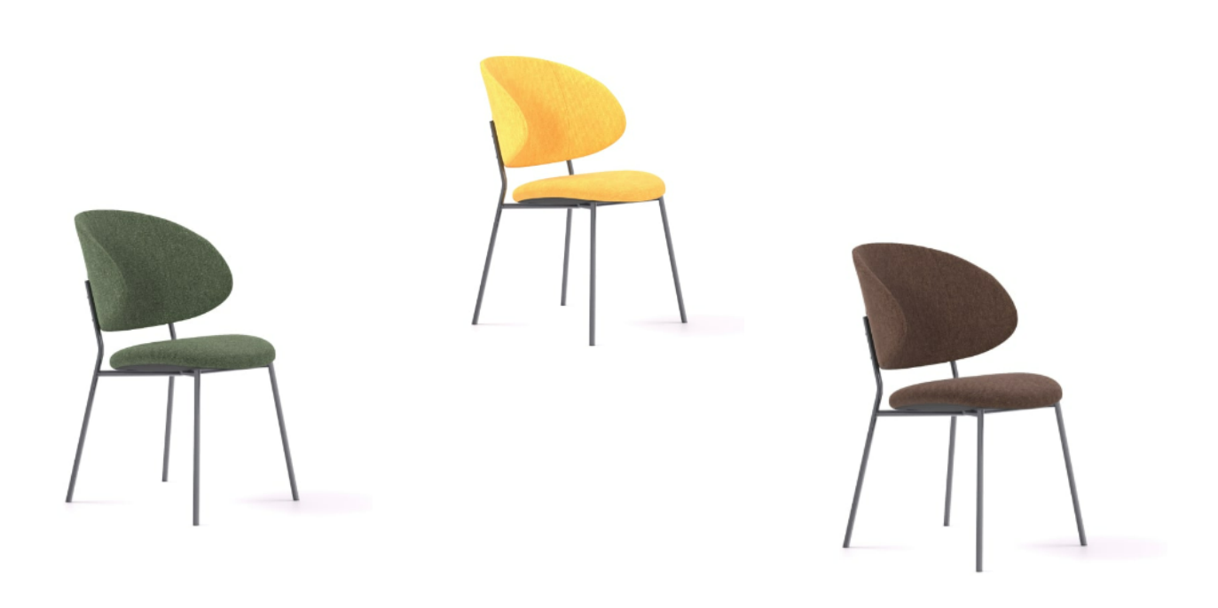
ST-2 Dining chair you can order in all fabrics